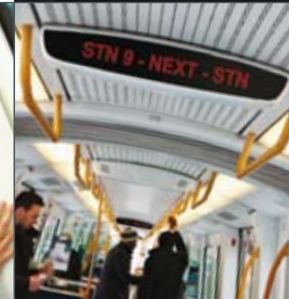
Integrated Passenger Information Systems