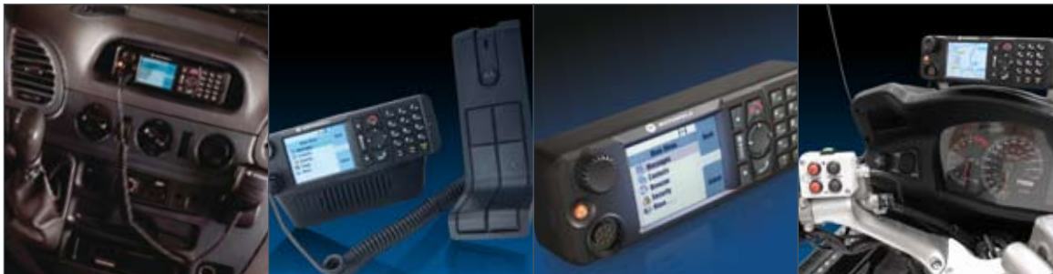
Vehicle dashboard configuration

Usability is enhanced by allowing control of the radio via external devices such as the control box next to the handgrip - simplifying common tasks such as talkgroup and volume level changes.