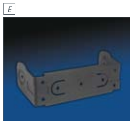
Trunion Mounting Brackets