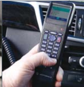
Integrated Vehicle Installations