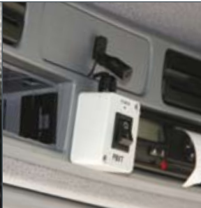
Pump Bay Voice Terminal switch