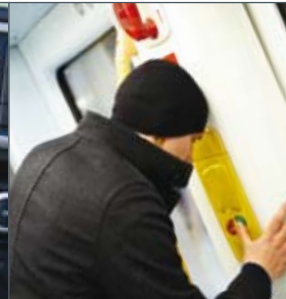
Customised Passenger Voice Terminals