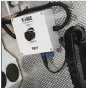
Pump Bay Voice Terminals for Fire & Rescue