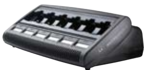
IMPRES Multi-Unit Charger WPLN4198