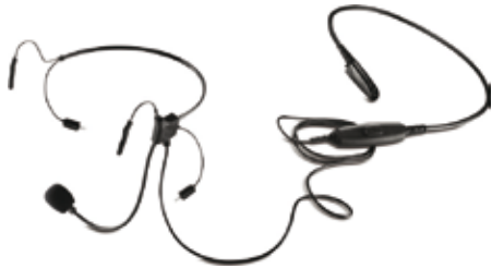
Behind-the-head Lightweight Headset PMLN5392

The benefits and assurance of the ATEX certification will be invalidated by using non-approved accessories. The Motorola ATEX accessories for the MTP850Ex have been fully tested to meet the ATEX standards. These can be used with confidence in gas and dust explosive risk areas.