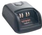
IMPRES Charger WPLN4199